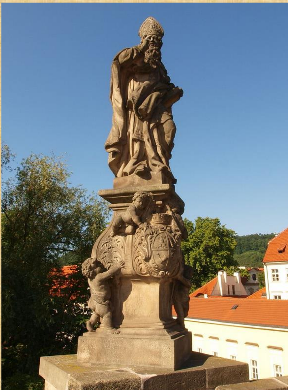
Saint Adalbert of Prague