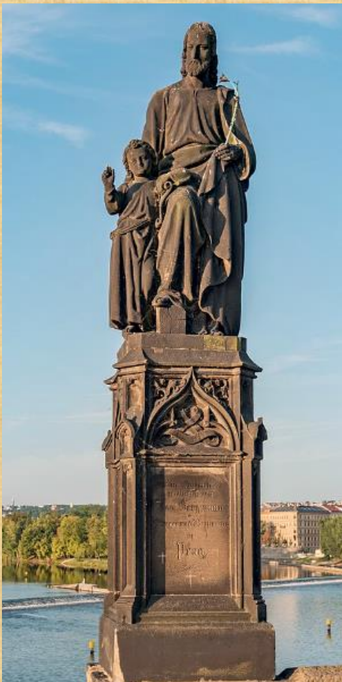
Saint Joseph with Jesus