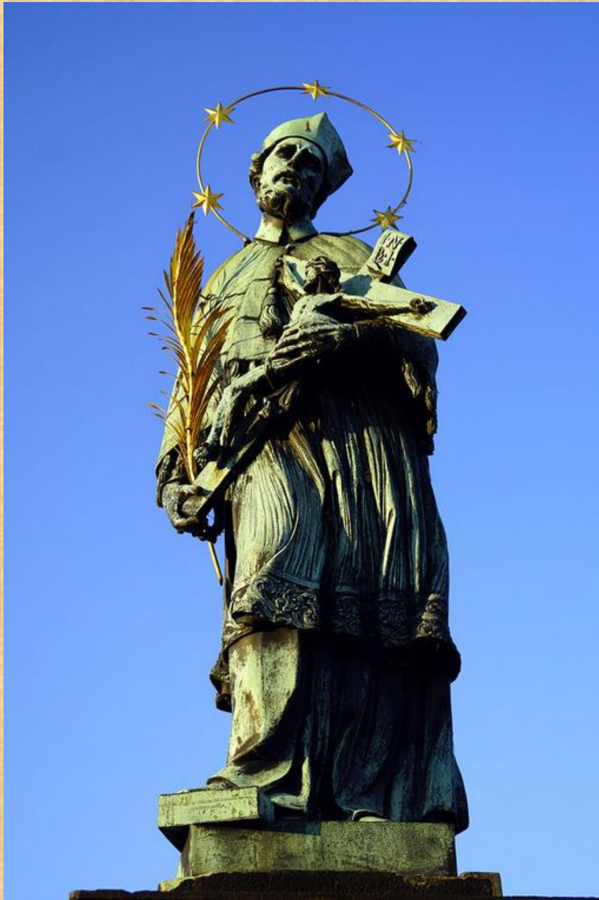
Saint John of Nepomuk