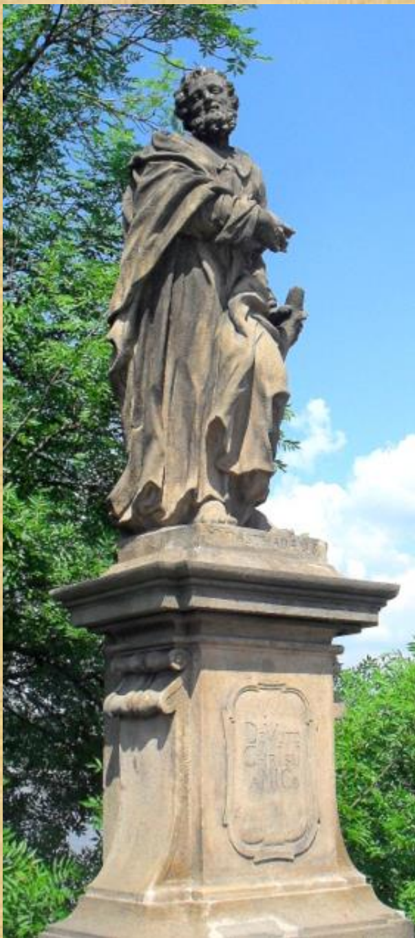
Saint Jude Thaddeus