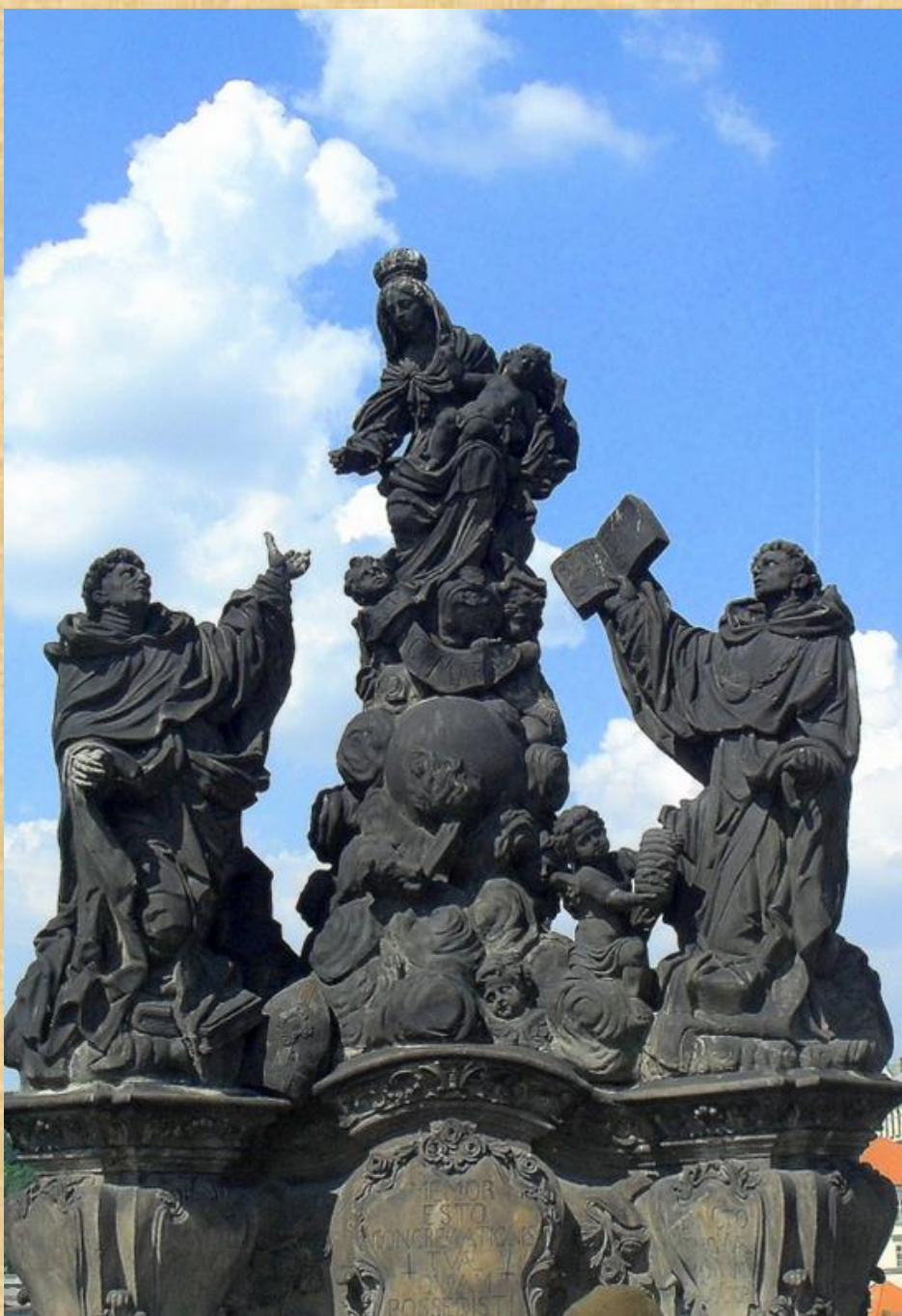
Madonna, Saint Dominic and Saint Thomas Aquinas