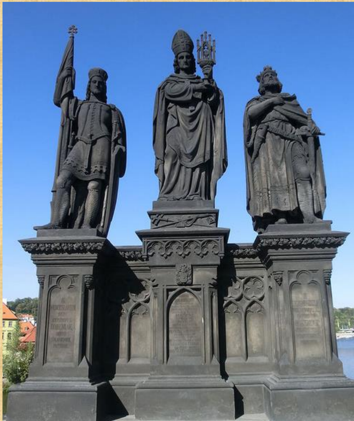
Saint Norbert, Saint Wenceslaus, Saint Sigismund