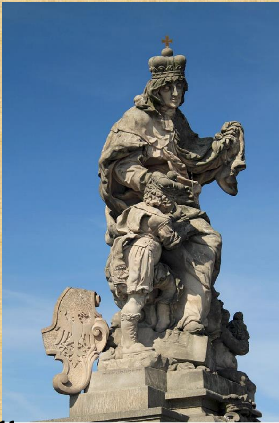
Saint Ludmila with Saint Wenceslaus