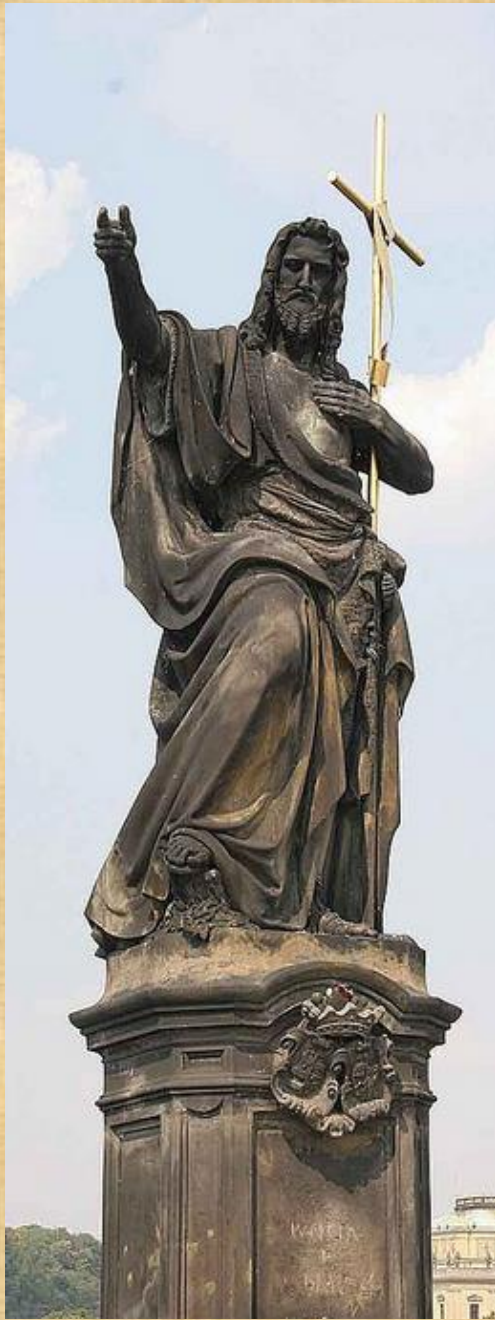
Saint John the Baptist