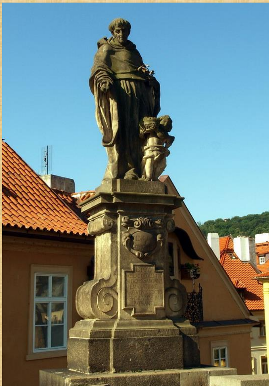
Saint Nicholas of Tolentino