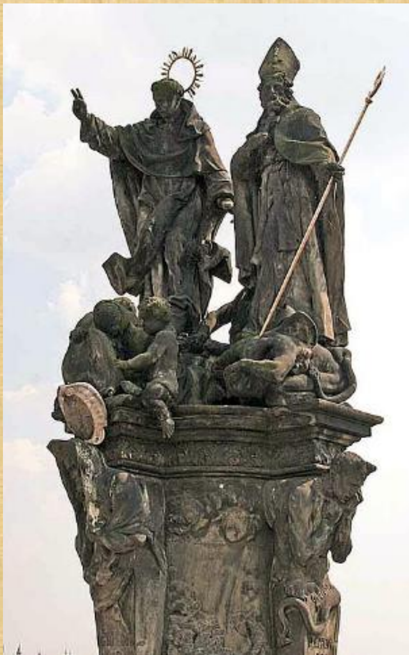
Saint Vincent Ferrer and Saint Procopius